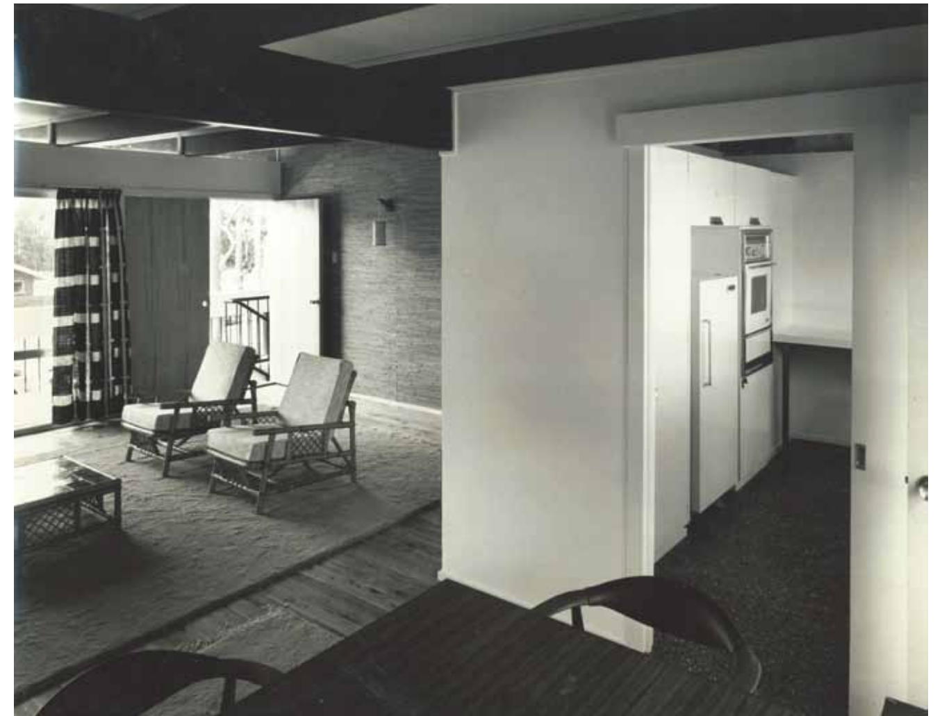
Beachcomber dining room, lounge, and kitchen area.