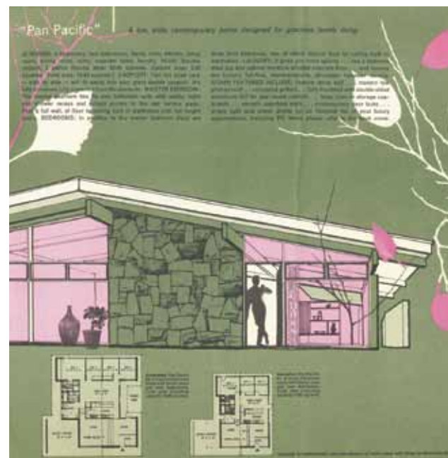
Pan Pacific, Lend Lease Homes for 1962 brochure