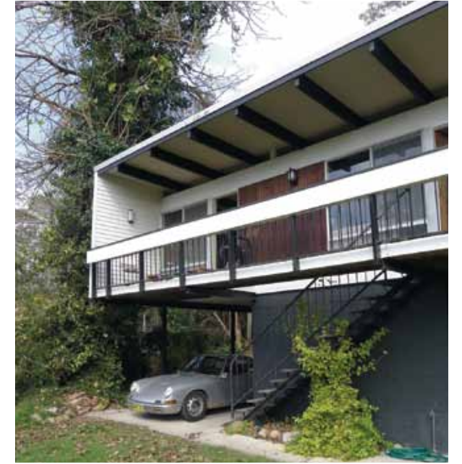
The authors Beachcomber Mark II (c1963) Faulconbridge, Blue Mountains NSW