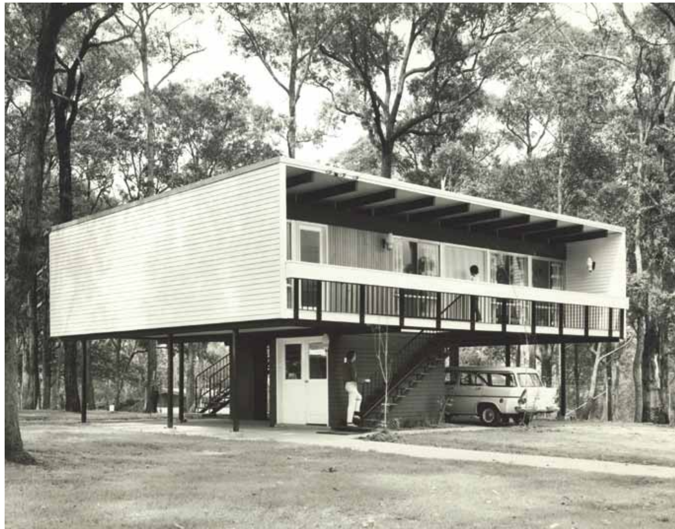
Exterior of a Beachcomber Mark 2. Carlingford NSW, Oct 1962.